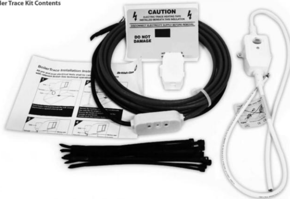
Boiler Trace Kit Contents

***AVOID FROZEN BOILER CONDENSATE*** *****PIPES THIS WINTER*****